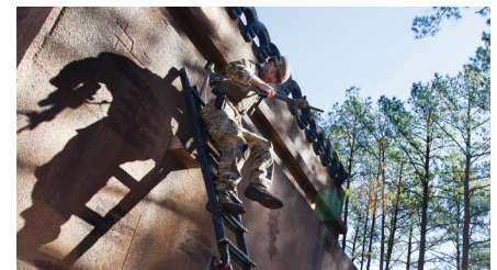
A soldier covers a helicopter’s landing during a training exercise (top). Fort Bragg USASOC holds an annual sniper competition where soldiers are tested in realistic combat environments (bottom).