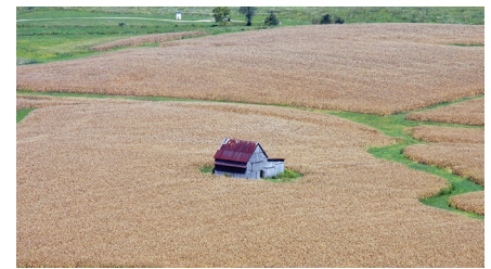
Farmland preserved near Fort Campbell (bottom) helps aviation training and operations capability (top).