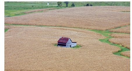
Farmland preserved near Fort Campbell (bottom) helps aviation training and operations capability (top).