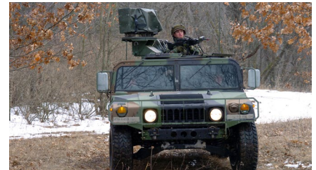
Hart's Lake, protected by REPI, provides recreational opportunities (top). A Humvee during a field training exercise (bottom).