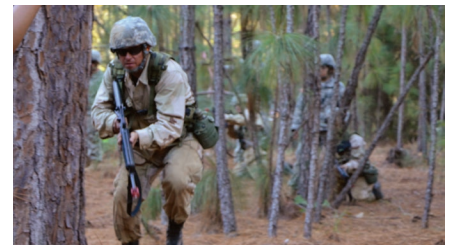
Medical personnel practice loading simulated casualties onto a HH-60M Blackhawk helicopter (top). Some training occurs near the longleaf pine ecosystem near Fort Eisenhower (bottom).