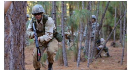
Medical personnel practice loading simulated casualties onto a HH-60M Blackhawk helicopter (top). Some training occurs near the longleaf pine ecosystem near Fort Gordon (bottom).