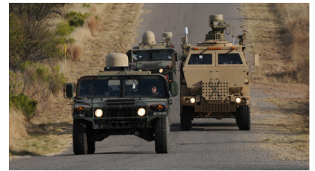
Soldiers training at the Joint Center of Excellence for Human Intelligence Training at Fort Huachuca (top). Test vehicles for the Warfighter Information Network-Tactical (bottom).