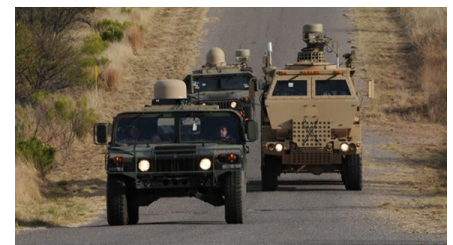
Soldiers training at the Joint Center of Excellence for Human Intelligence Training at Fort Huachuca (top). Test vehicles for the Warfighter Information Network-Tactical (bottom).