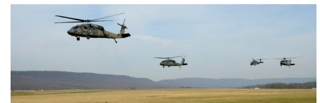
Fort Indiantown Gap hosts multiple ground-based training activities such as joint armored war fighting exercises (top), and multiple aviation-related training activities (bottom).