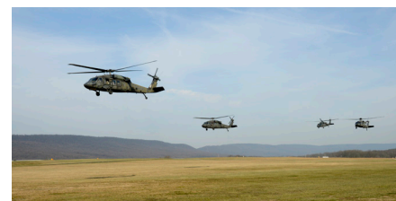
Fort Indiantown Gap hosts multiple ground-based training activities such as joint armored war fighting exercises (top), and multiple aviation-related training activities (bottom).