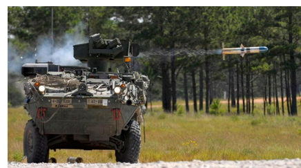
A Chinook helicopter performing an exercise (top) and a Stryker vehicle firing a missile (bottom) at the Joint Readiness Training Center.