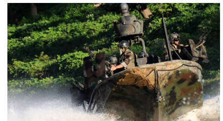
A squadron engages in a live-fire training exercise (top), while a special boat team participates in a drill at the riverine training range at Fort Knox (bottom).