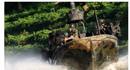
A squadron engages in a live-fire training exercise (top), while a special boat team participates in a drill at the riverine training range at Fort Knox (bottom).