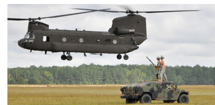
Training at Fort Pickett includes working in a joint service environment for maneuver (top) and sling load operations, which include rigging a humvee to a helicopter (bottom).