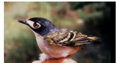
Protecting habitat for the black-capped vireo (bottom) near Fort Sill helps to preserve heavy artillery training, such as that conducted with the Paladin Howitzer (top).