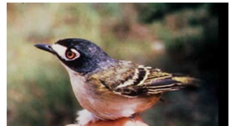
Protecting habitat for the black-capped vireo (bottom) near Fort Sill helps to preserve heavy artillery training, such as that conducted with the Paladin Howitzer (top).