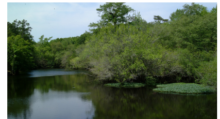
Maneuver training at Fort Stewart (top). Habitat and water supplies protected by Fort Stewart REPI projects (bottom).