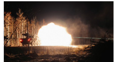
Soldiers test their physical endurance and perform basic Arctic warrior tasks such as an Ahkio sled pull (top). A Stryker Mobile Gun System fires a high explosive round at simulated targets during nighttime qualifying maneuvers (bottom).