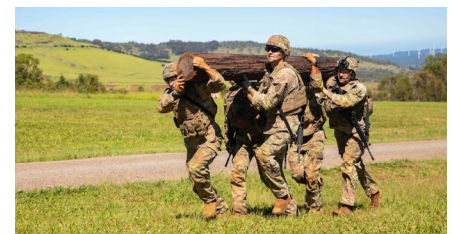
A mortar team prepares to fire a round from a 120mm mortar system at Pōhakuloa Training Area, Hawaii (top). Military training is conducted across USAG Hawaii ranges and installations, such as Schofield Barracks (bottom).