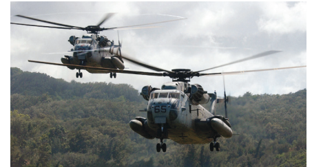
Birds of a feather: Preserving habitat for the endangered ‘elepaio bird (top) helps to preserve helicopter training (bottom).