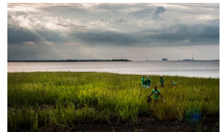
Globemaster III from the 437 th Airlift Wing at Charleston Air Force Base, S.C., performs a combat landing during an incentive flight recently (top). Airmen volunteer to cleanup the marsh at Waterfront Park for trash and debris carried in from the ocean (bottom).