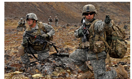
Soldiers from 1 st Squadron (Airborne), 40 th Cavalry Regiment train in preparation for deployment at Joint Base Elmendorf-Richardson.