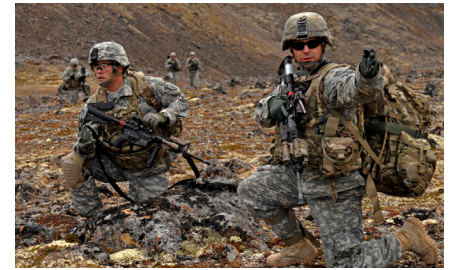
Soldiers from 1st Squadron (Airborne), 40th Cavalry Regiment train in preparation for deployment at Joint Base Elmendorf-Richardson.