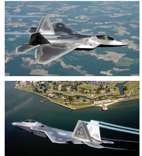
The first operational F/A-22 Raptor flies over nearby rural areas as it is delivered to its permanent home at Langley AFB (top). Located in the Hampton Roads metro area, Langley AFB is surrounded by development but has easy access to over-water flight areas (bottom).

Subtotals may not sum to combined totals due to rounding