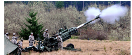
Joint Base Lewis-McChord's ranges contains some the only remaining south Puget Sound prairie habitat (top), which supports rare animal species and live-fire training exercises (bottom).