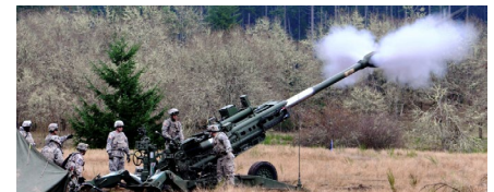
Joint Base Lewis-McChord's ranges contains some of the only remaining south Puget Sound prairie habitat (top), which supports rare animal species and live-fire training exercises (bottom).