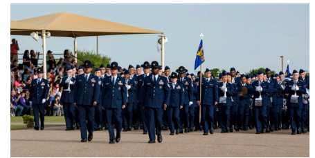
Welcome sign to JBSA-Lackland (top). Airmen and military training instructors march in a basic military training graduation parade (bottom).