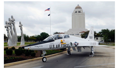
The JBSA-Randolph Tower is the headquarters for the 12th Flying Training Wing (top). T-38 "White Rocket" is on display in front of the 12th Flying Training Wing Headquarters at JBSA-Randolph (bottom).