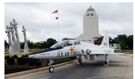
The JBSA-Randolph Tower is the headquarters for the 12th Flying Training Wing (top). T-38 "White Rocket" is on display in front of the 12th Flying Training Wing Headquarters at JBSA-Randolph (bottom).