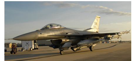
Preserved buffer land benefits vehicle maneuver exercises (top) and F-16 training (bottom).