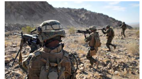
The Chocolate Mountain Aerial Gunnery Range includes the aerial range depicted above with an AH-1W “Super Cobra” attack helicopter providing close air support (top) and the Camp Billy Machen desert warfare training facility during a live-fire ambush and reaction drill (bottom).