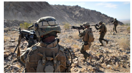
The Chocolate Mountain Aerial Gunnery Range includes the aerial range depicted above with an AH-1W "Super Cobra" attack helicopter providing close air support (top) and the Camp Billy Machen desert warfare training facility during a live-fire ambush and reaction drill (bottom).