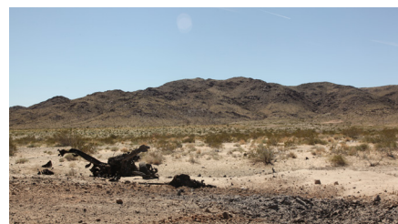
MCAGCC 29 Palms’ desert terrain provides an ideal pre-deployment training environment (top), including post-blast investigation of improvised explosive devices (IEDs, bottom).