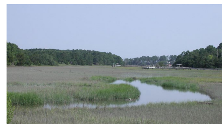
MCAS Beaufort hosts training on aircraft such as the F/A-18 Hornet (top). Preserved wetlands near the installation help to protect area water quality (bottom).