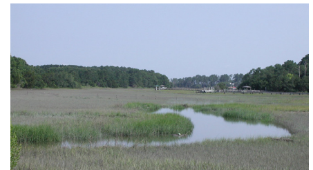
MCAS Beaufort hosts training on aircraft such as the F/A-18 Hornet (top). Preserved wetlands near the installation help to protect area water quality (bottom).