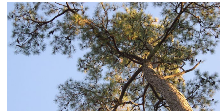
Amphibious training at MCB Camp Lejeune (top). Projects help preserve the longleaf pine ecosystem (bottom), which aids red-cockaded woodpecker recovery and sustainment.