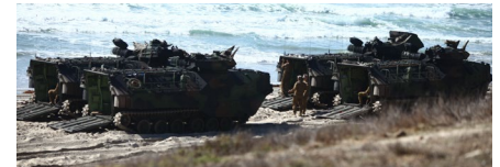
Coastal mountains provide habitat and training (top). Amphibious training at Camp Pendleton's beaches (bottom).