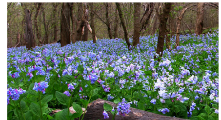
A squad of officer candidates charge forward into the Quigley water obstacle (top). Merrimac Farm, protected with REPI and partner funds, has one of the largest patches of Virginia bluebell flowers (bottom,).