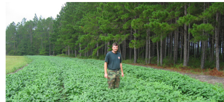
Habitat in and around Townsend Bombing Range (top and bottom) helps preserve the range’s training capability.