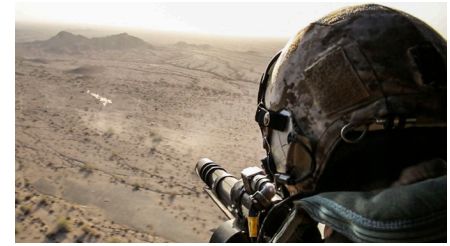
NAF El Centro’s location, weather, and training ranges make it a perfect winter home of the Blue Angels (top). The compatible landscape also supports live-fire training with the M134 minigun on a UH-1Y Venom helicopter (bottom).