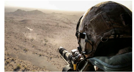
NAF El Centro's location, weather, and training ranges make it a perfect winter home of the Blue Angels (top). The compatible landscape also supports live-fire training with the M134 minigun on a UH-1Y Venom helicopter (bottom).