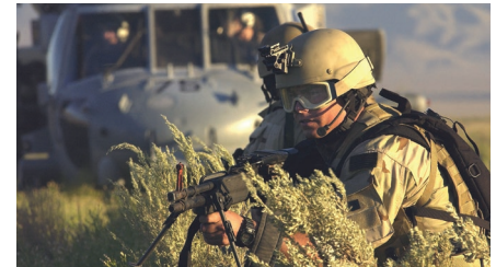
Helicopter training on desert terrain (top). Desert scrub brush provides partial camouflage for ground training efforts (bottom).