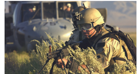
Helicopter training on desert terrain (top). Desert scrub brush provides partial camouflage for ground training efforts (bottom).