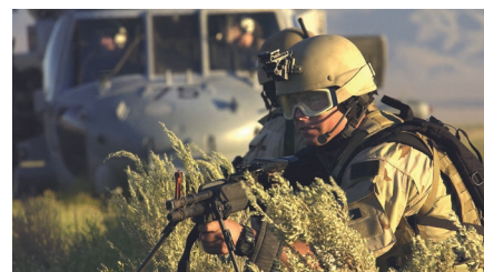
Helicopter training on desert terrain (top). Desert scrub brush provides partial camouflage for ground training efforts (bottom).