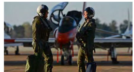
As one of two Navy jet strike pilot training facilities, NAS Meridian hosts Training Air Wing-1 and the T-45 Goshawk (top), used to train Navy and Marine Corps student aviators (bottom).