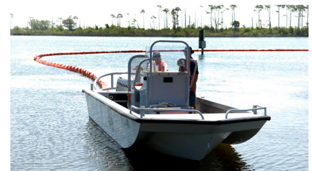
The Blue Angels demonstration squadron performs a maneuver over NAS Pensacola (top). In 2010, the air station deployed a pollution response unit to protect the environmentally sensitive grass beds from the Deepwater Horizon oil spill (bottom).