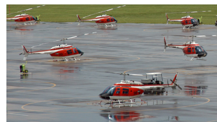
Helicopter training at NAS Whiting Field (bottom) is ideally situated for the Navy’s offshore missions (top).