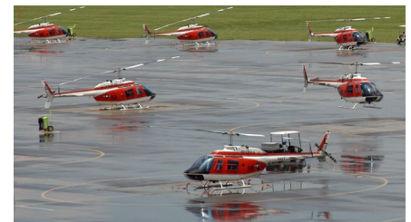
Helicopter training at NAS Whiting Field (bottom) is ideally situated for the Navy's offshore missions (top).