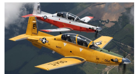
NAS Whiting Field is ideally situated for the Navy's offshore TH-73 (top) and T-6B missions (bottom).