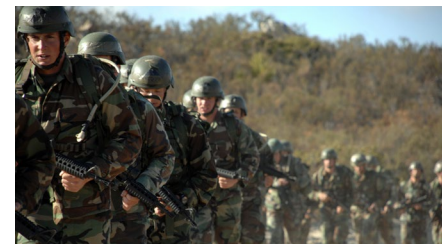
Navy SEALs spend two weeks training in special warfare at Camp Michael Monsoor before earning their qualification (top and bottom).