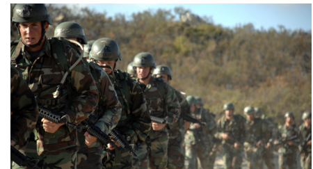
Navy SEALs spend two weeks training in special warfare at Camp Michael Monsoor before earning their qualification (top and bottom).