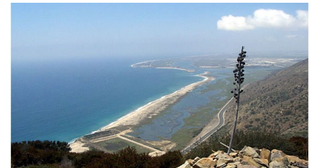
A F/A-18 Super Hornet flies over the Sea Range and NB Ventura County (top). Mugu Lagoon is potentially the largest coastal wetland in southern California (bottom).