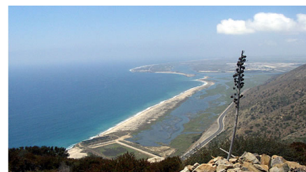
A F/A-18 Super Hornet flies over the Sea Range and NB Ventura County (top). Mugu Lagoon is potentially the largest coastal wetland in southern California (bottom).