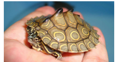
Members of Special Boat Team-22 and other Navy Special Forces and military units from other nations use the riverine training environment at the Stennis Western Maneuver Area (top). The surrounding habitat is also home to threatened species like the ringed map turtle (bottom).