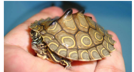
Members of Special Boat Team-22 and other Navy Special Forces and military units from other nations use the riverine training environment at the Stennis Western Maneuver Area (top). The surrounding habitat is also home to threatened species like the ringed map turtle (bottom).