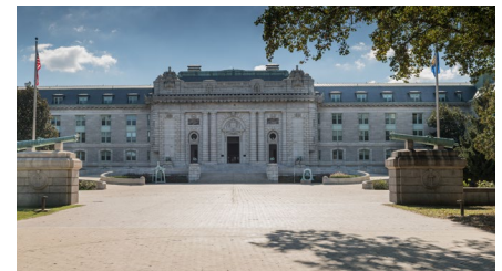
The United States Naval Academy is bordered on three sides by the Annapolis Harbor, Severn River and College Creek, the latter of which is shown in the top photo with Alumni Hall and the Naval Academy Chapel Dome. Pictured below is Memorial Hall which commemorates all alumni of the Naval Academy especially those who have fallen in combat or been awarded the Medal of Honor.