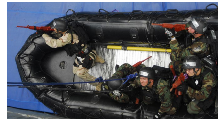
NSA Hampton Roads, Northwest Annex also conducts simulated visit, board, search and seizure training courses, which include rappelling and container search maneuvers (top) and non-compliant vessel boarding exercises (bottom).