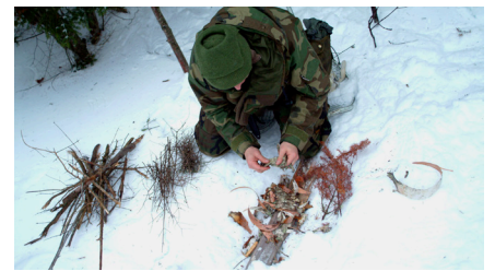
SERE School field training at the Redington property in Maine (top) provides sailors with basic survival skills like starting a fire in harsh, remote environs (bottom).