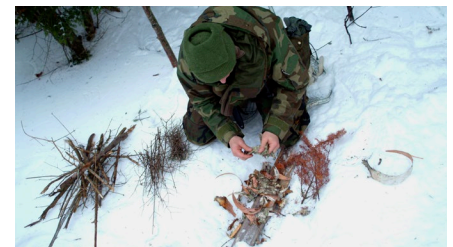
SERE School field training at the Redington property in Maine (top) provides sailors with basic survival skills like starting a fire in harsh, remote environs (bottom).