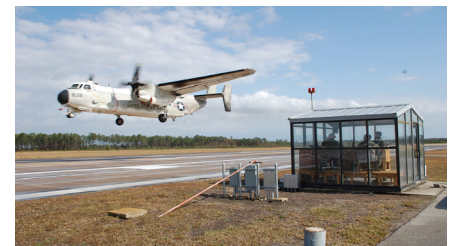
A historical 1944 aerial (top) of OLF Whitehouse demonstrates the numerous runways (bottom) that are a vital and unique asset today.