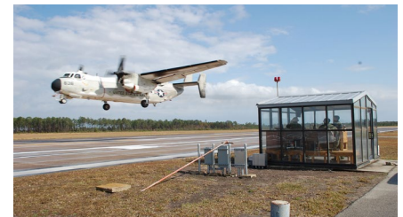
This project contributes to a larger plan to protect OLF Whitehouse (below) and NAS Jacksonville (above) and link natural resource corridors and create a greenway between state parks.