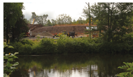
The new Armed Forces Reserve Center serves as a “virtual installation” for Army Reserve soldiers from Maine to Virginia (top). Construction of the new building prompted wetlands mitigation efforts (bottom).