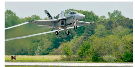
NAS Patuxent River and the Atlantic Test Ranges serve as an important flight testing site (top). Testing an F/A-18 Hornet that runs on 50% biofuel (bottom).