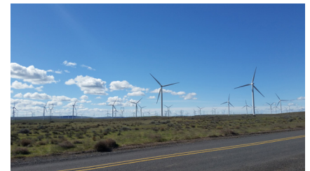
EA-6B and EA-18G aircraft from NAS Whidbey Island require unobstructed, flat terrain for low-altitude airborne electronic attack training (top). Wind energy turbines as tall as 500 feet present a significant threat to that training mission (bottom).