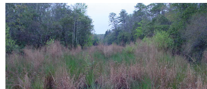
A F/A-18 Super Hornet conducts a routine training exercise above Dare County Bombing Range (top). The range includes forested wetlands and other habitat (bottom).