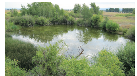
A survival, evasion, resistance and escape specialist performs a static line parachute jump above Fairchild AFB (top). This project prevents retention ponds (bottom) that can attract birds or wildlife that present a bird aircraft strike hazard.