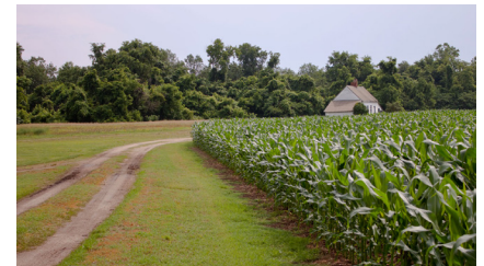
Marine Humvees conducting training exercises (top). Camden Farm, preserved through REPI (bottom).