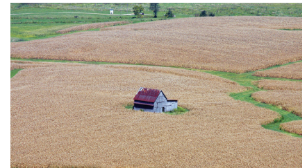
Farmland preserved near Fort Campbell (bottom) helps aviation training and operations capability (top).