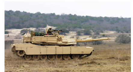
Fort Hood's training lands support intensive and varied training requirements, such as a convoy training exercise containing a road block scenario (top). Buffers help protect against noise conflicts from live-fire exercises with the M1A2 Abrams tank (bottom).