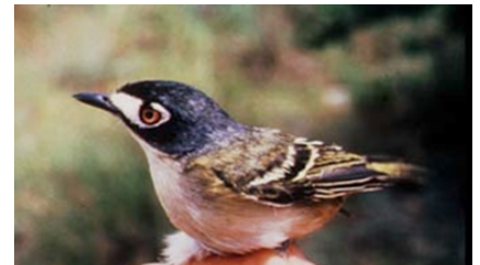
Protecting habitat for the black-capped vireo (bottom) near Fort Sill helps to preserve heavy artillery training, such as that conducted with the Paladin Howitzer (top).